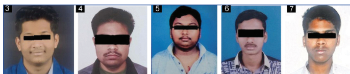
[Table/Fig-3-7]: Different types of faces. (Image from left to right)

Nasal index: Width of nose (al-al)/Length of nose (n-sn)×100.